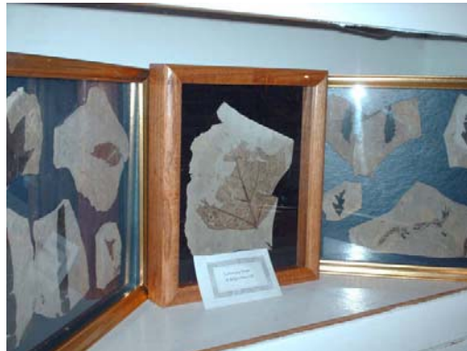
People's Choice Display Case