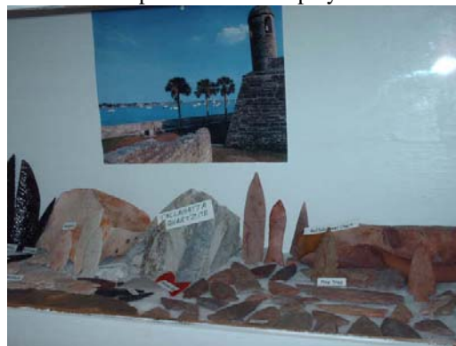
Display Case – Sonny Hall